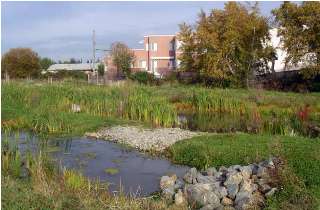
Peers Creek ~ South Wilkinson Valley