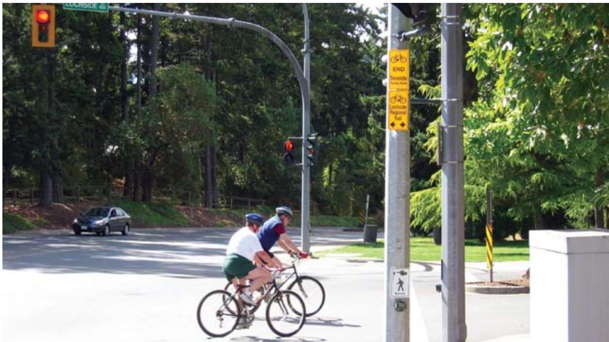
Royal Oak Drive at Lochside Drive