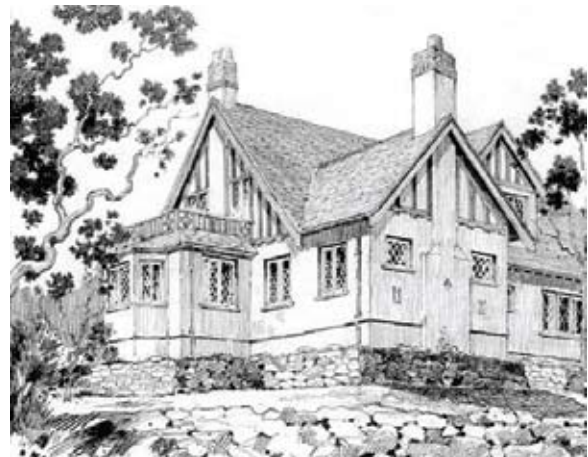
Spurgin Residence on Waterloo ~ 1928

Following World War II, Saanich became a major residential area within a suburban community serving Greater Victoria. Today, with an estimated 2007 population of 113,529, Saanich is the most populated Municipality on Vancouver Island, and the seventh most populated in the province. The urban landscape comprises distinctive low-density neighbourhoods, primarily single-family, serviced by higher density Village, Neighbourhood and Regional mixed-use Centres, plus several regionally important industrial and institutional nodes.