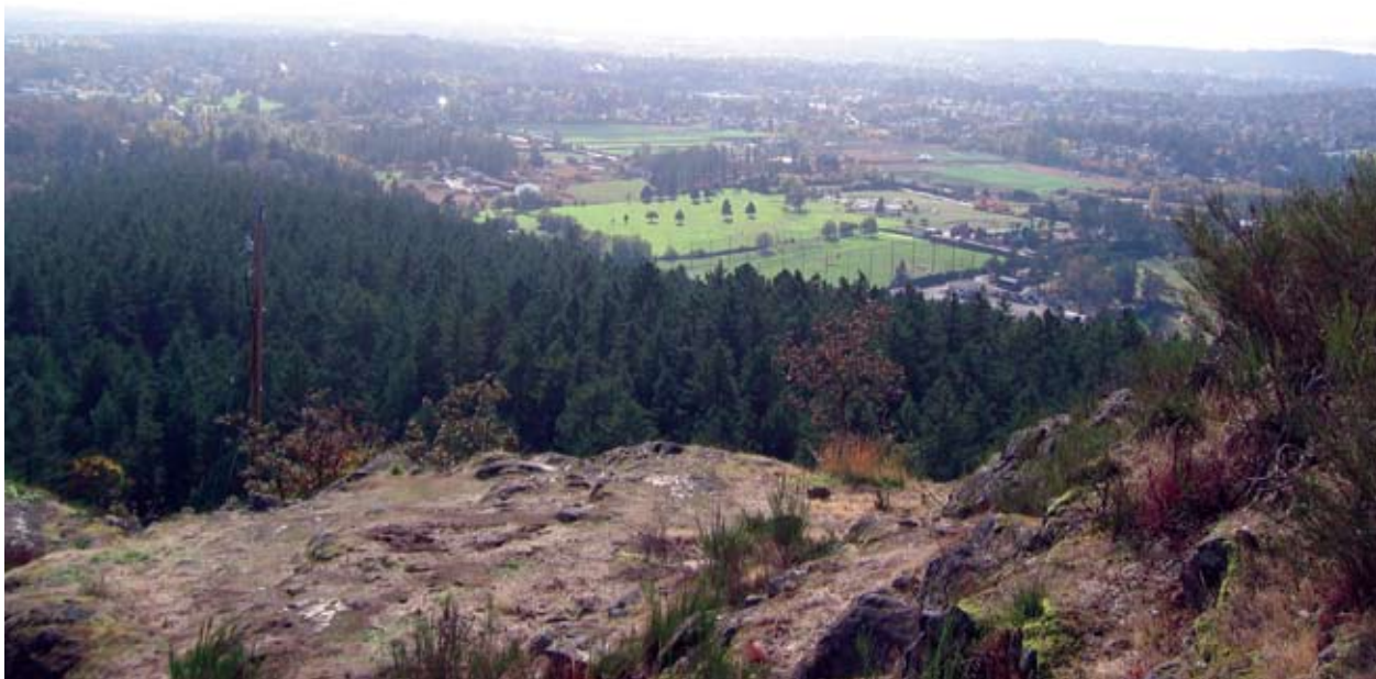
Summit of Mt. Douglas - looking west

Section 866 of the Local Government Act requires that each Capital Regional District member Municipality prepare, as part of its Official Community Plan, a Regional Context Statement that identifies and defines the specific strategic directions and policy links between the Official Community Plan and the Regional Growth Strategy.