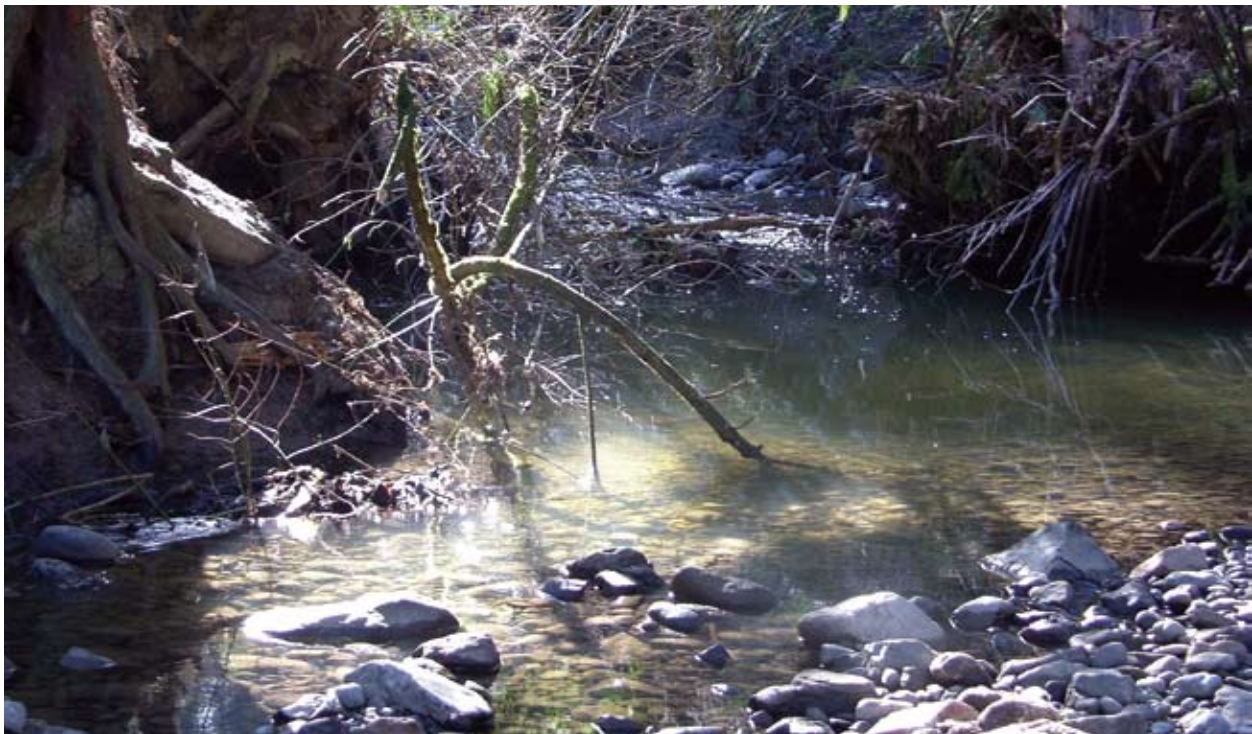
Mt. Douglas Park

Ongoing and effective stewardship of the environment in the future calls for a renewed and enhanced commitment to habitat creation and protection, preservation of biodiversity, water and energy conservation, and measures to improve efficient land use and air quality. Sustainability practices also need to be entrenched into the management of growth and development, and as part of all corporate and community decision-making.