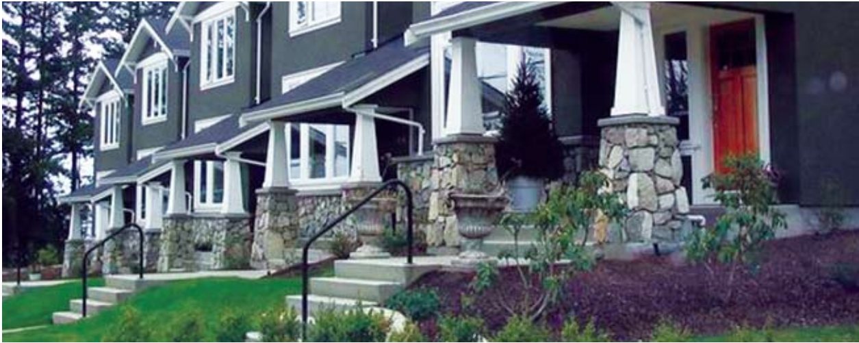
Sayward Hill ~ Cordova Bay