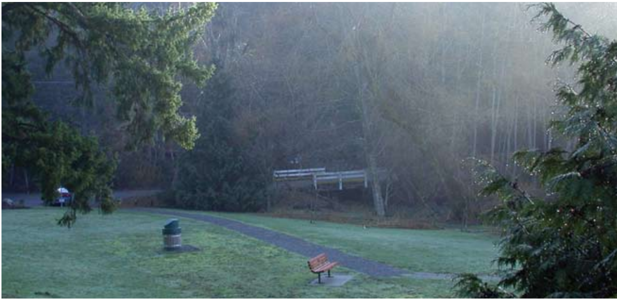
Whitehead Park ~ Tod Creek