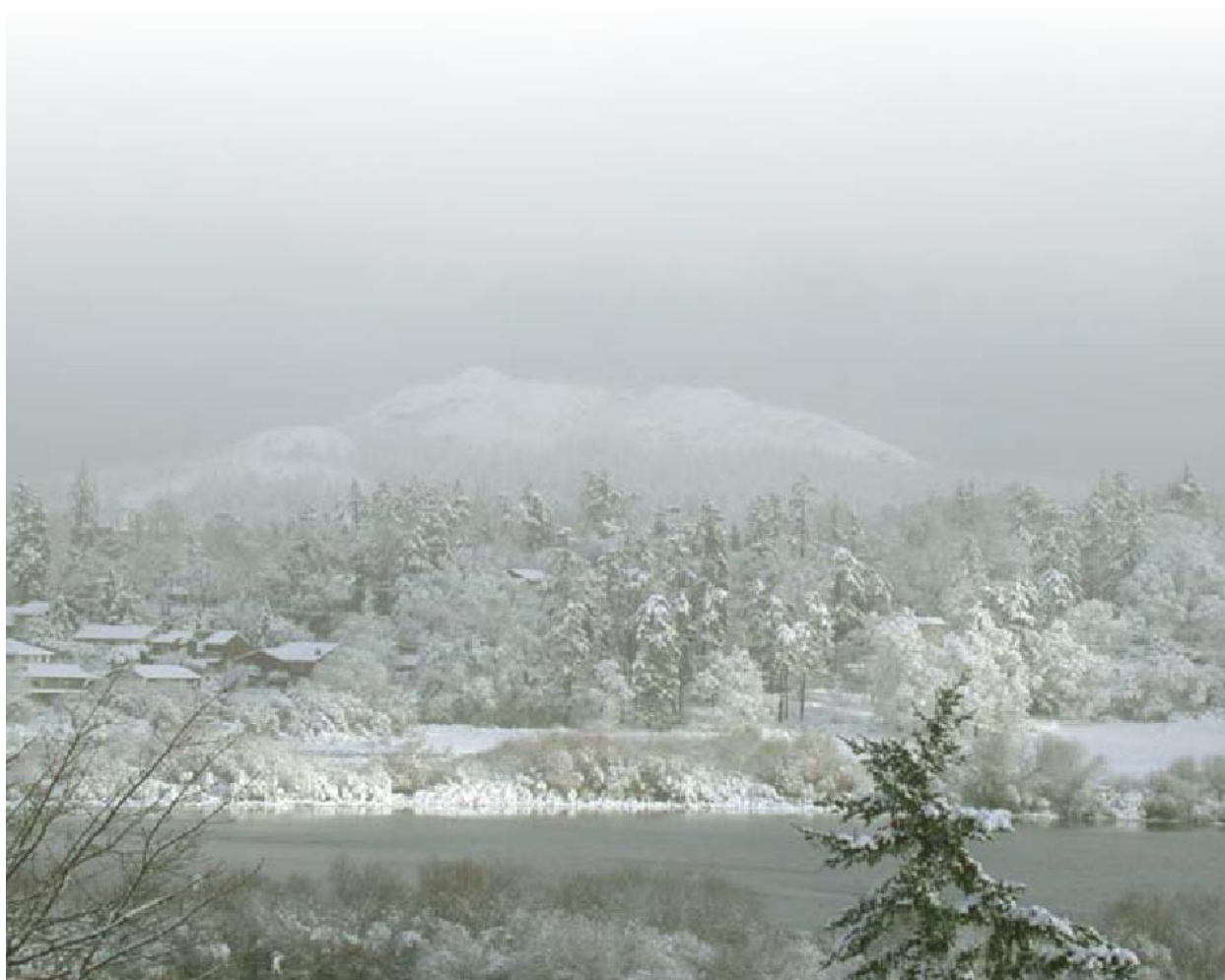
Christmas Hill and Swan Lake