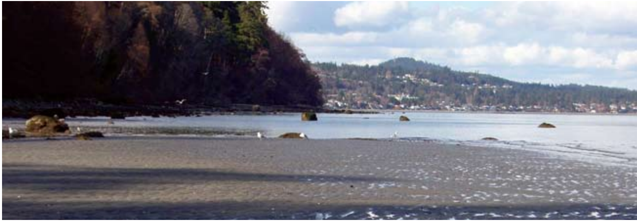
Mt. Douglas Park