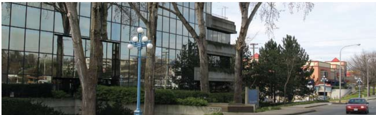
Douglas Street ~ looking north