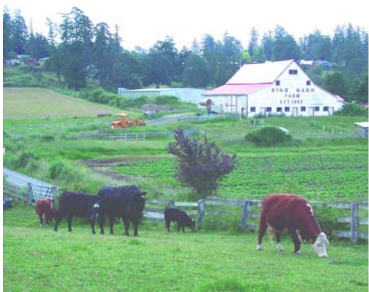
High Oaks Farm ~ 1893

Rural Saanich is valued by its residents and by those from outside the area for its natural beauty, diverse environments, high biological diversity, agricultural and well-forested lands, and rural lifestyle. The diversity of the natural environment and variety of environmental features remain today, primarily as a result of ongoing stewardship by local residents and Saanich's leadership in implementing growth management, environmental protection, and other planning concepts to retain the character of the area and the health of its natural systems.