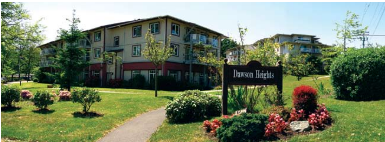
Dawson Heights~ Independent & supportive housing for seniors