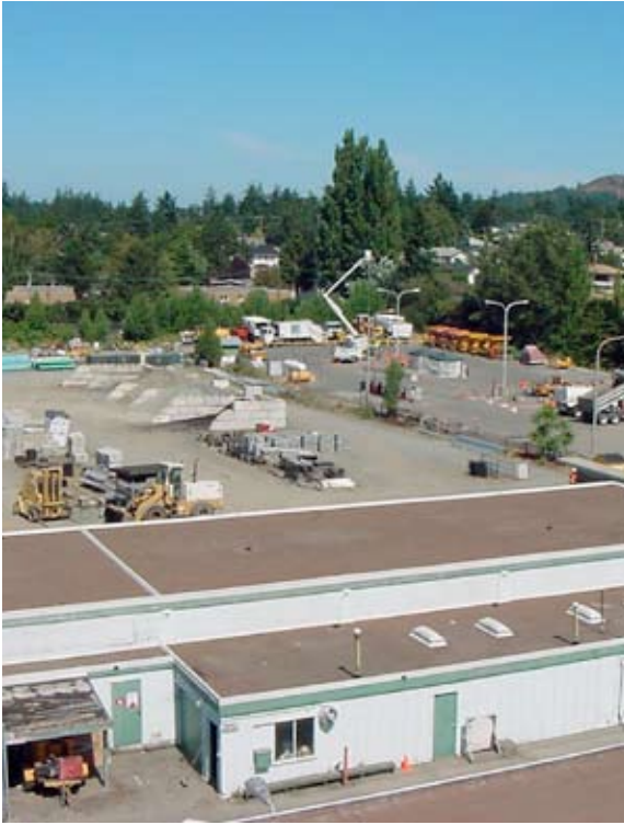
Saanich Public Works yard

Industrial land uses comprise a significant part of Saanich's built environment (Map 8) and play an important role in our local economy. Next to the City of Victoria, Saanich has the second largest amount of industrial square footage in the region. Industrial areas include the Royal Oak Industrial Park and Douglas Street West Industrial Area. In addition to these areas, industrial-type uses occur on a number of properties in Saanich, including the Hartland Landfill, operated by the Capital Regional District.