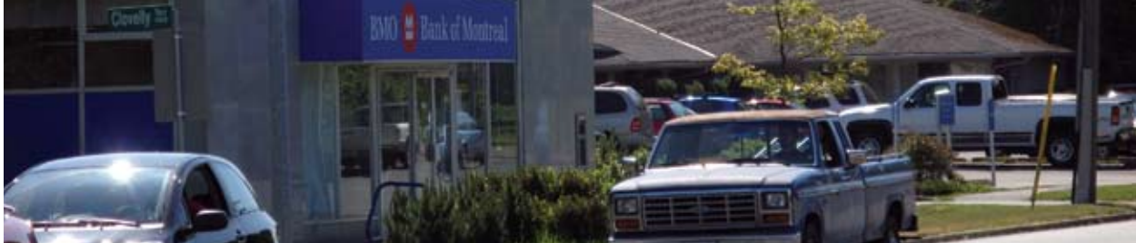
Cook Street ~ looking southeast