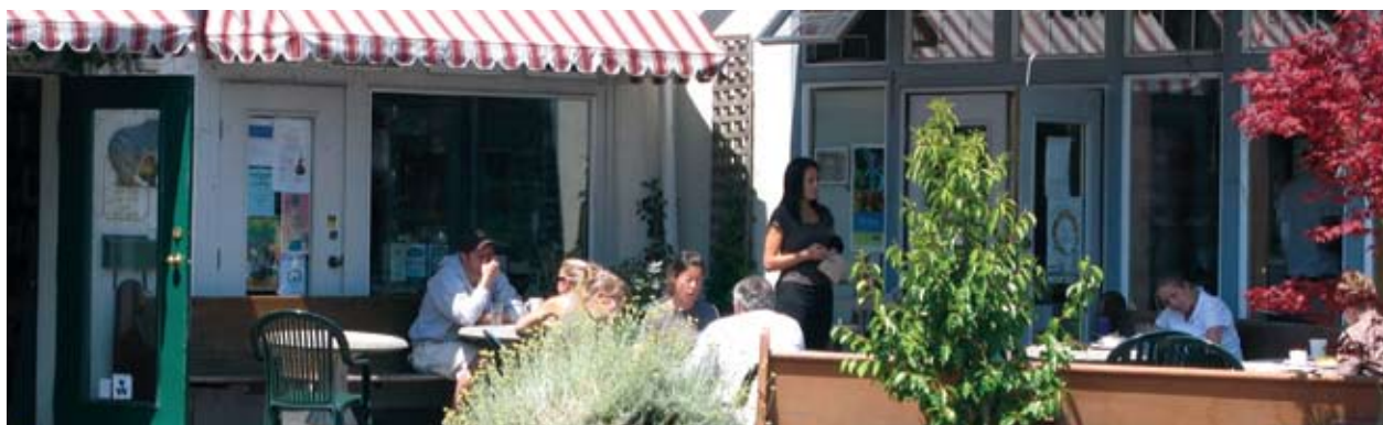
Cadboro Bay Village