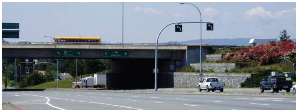
Patricia Bay Highway / McKenzie Avenue interchange