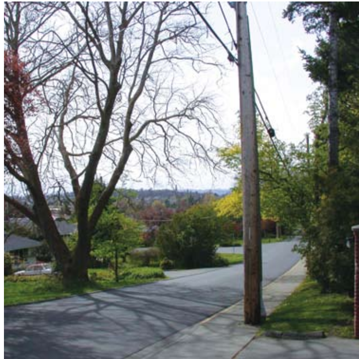
McRae Avenue ~ looking west

While the majority of future growth in Saanich will be focused on “Centres” and “Villages,” residential infill will continue to take place on a limited scale. Successful infill developments must take into consideration the capacity of transportation and underground services to accommodate change and the existing character