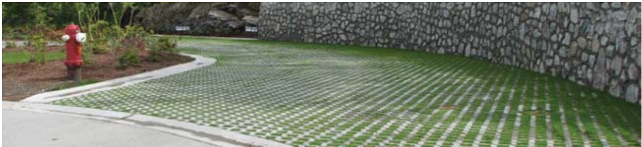
Stormwater Management ~ South Wilkinson Valley