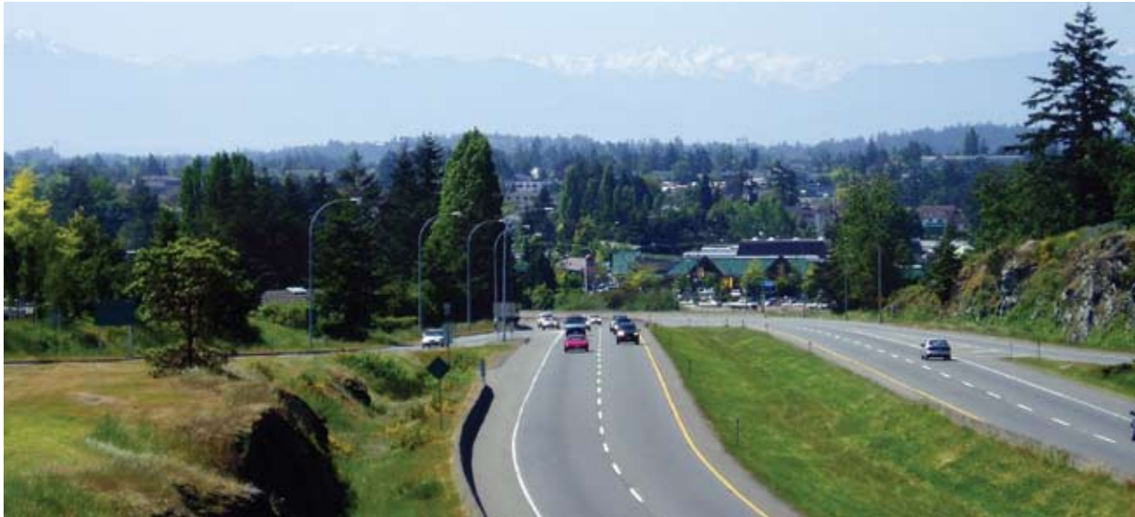
Patricia Bay Highway ~ looking south