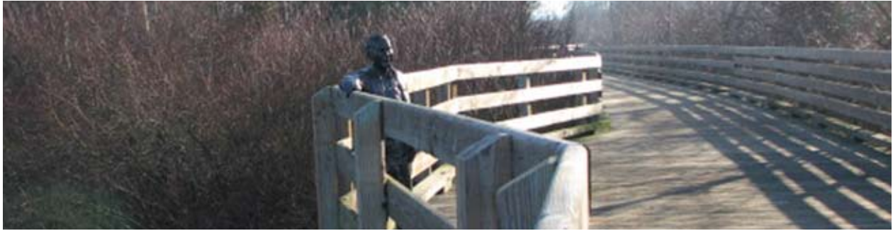
"Roy" - Blenkinsop Bridge