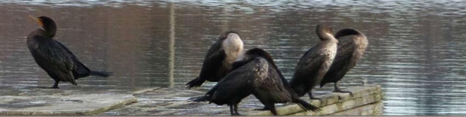
Cormorants at Swan Lake