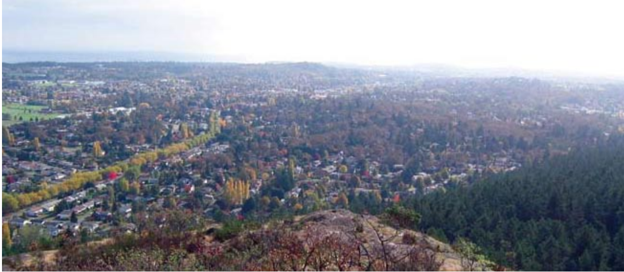
Mt. Douglas summit ~ looking south