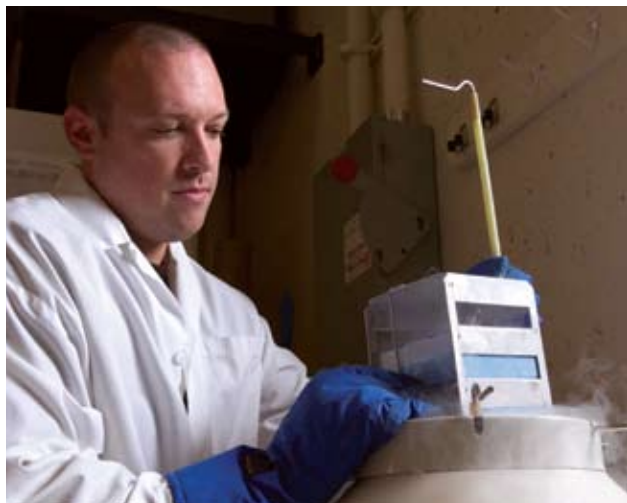
Vancouver Island Technology Park

Diversifying and enhancing Saanich's economy has the potential to lay the groundwork for future economic, social, and environmental sustainability. A strong local economy will help to provide economic stability and resilience, spin-off opportunities for the primary and service sectors, preservation of agricultural capability in rural areas, promotion of local resource value-adding, increased support for local businesses and producers, employment and income, and increased demand for locally produced goods and materials.