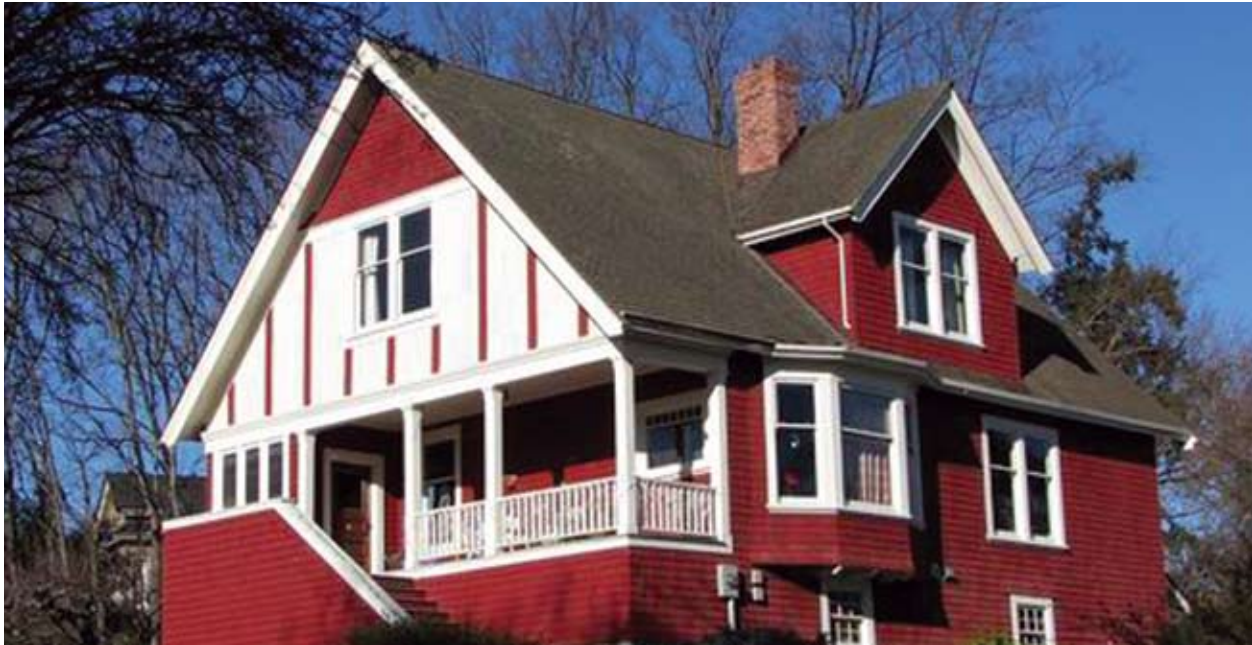
Munro Residence on Gorge ~ 1903