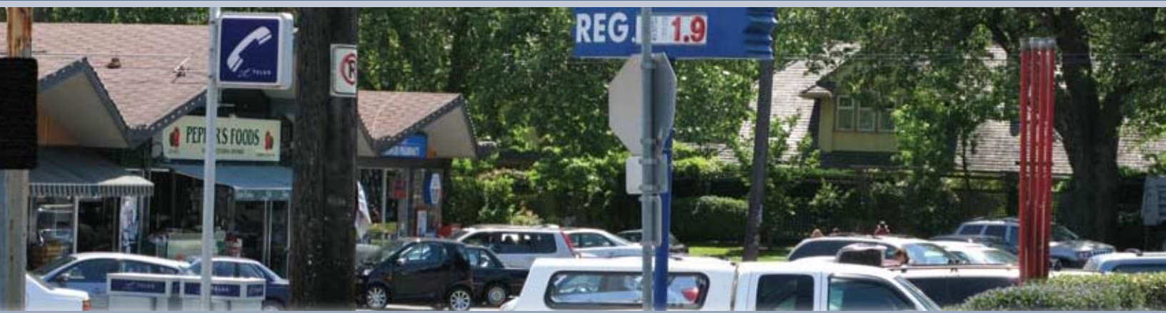
Cadboro Bay Village