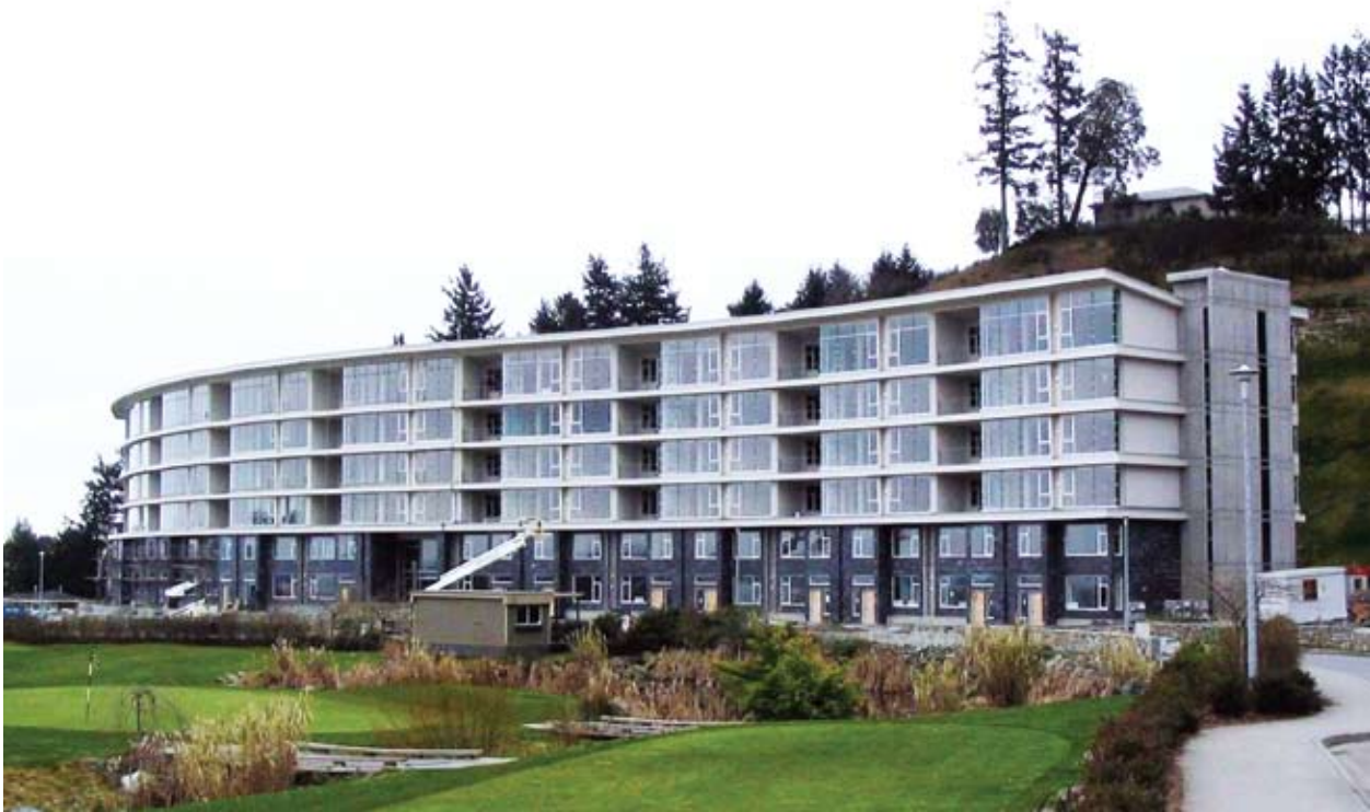
Sayward Hill ~ Cordova Bay