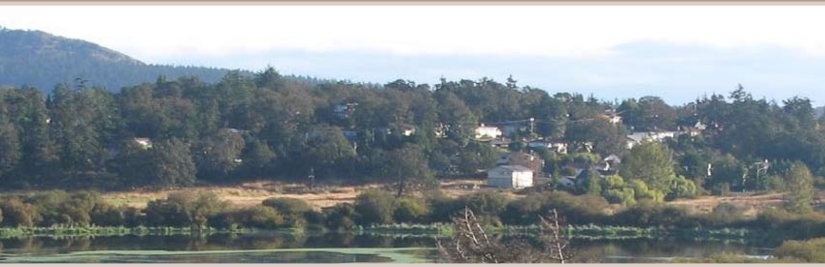
Christmas Hill and Swan Lake