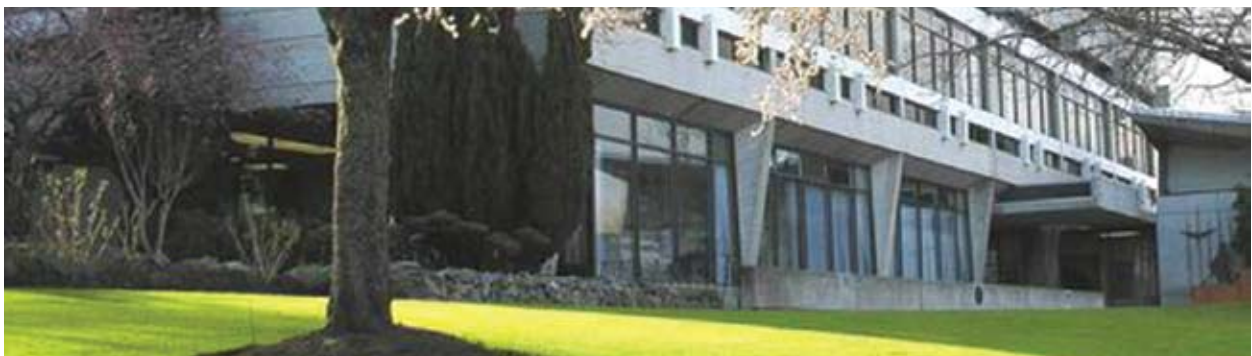
Saanich Municipal Hall