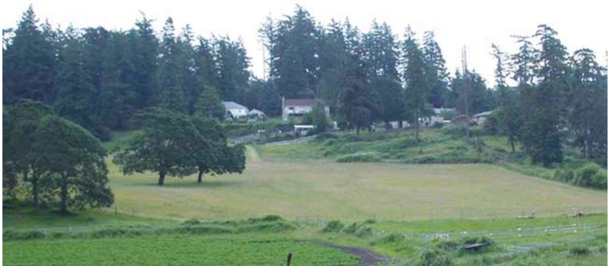
Hastings Street ~ looking south

Saanich, with an area of 103.44 km 2 (39.94 sq. mi.), is the largest Municipality in the Capital Region. It occupies a major and central position within the region – immediately north of the City of Victoria and sharing boundaries with Highlands, View Royal, Esquimalt, Oak Bay, and Central Saanich. As the gateway to the metropolitan core, Saanich provides key transportation links to the airport, ferry terminal, Western Communities, Saanich Peninsula, and the rest of Vancouver Island. Saanich’s physical setting comprises 29.61 km (18.39 mi.) of marine shoreline, 3.3 km 2 (1.3 sq. mi.) of freshwater lakes, numerous natural watercourses, a diverse undulating topography with elevations ranging from sea level to 355 m (1164 ft.), and a landscape that includes glacially scoured rock outcroppings, farmland, dense woodlands, and an extensive system of open space and parkland. Approximately half the Municipality is urban and half rural/agricultural – a dual role that has influenced its character and development.