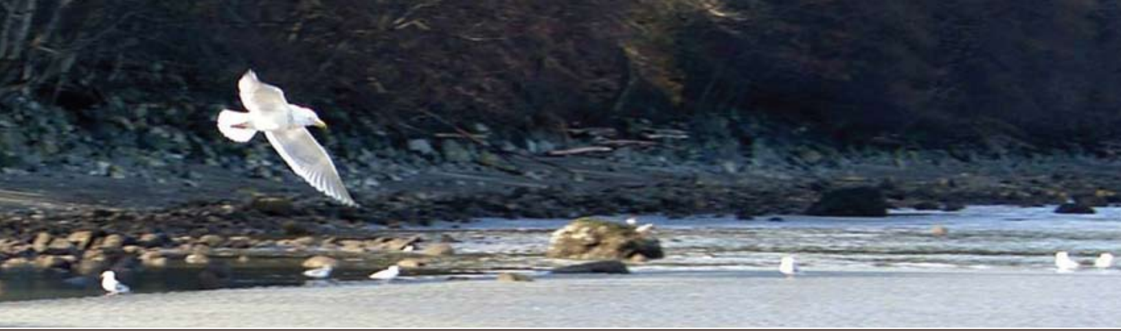
Mt. Douglas Park

Perhaps most importantly, plans are only effective if there is a willingness to implement them through the use of appropriate planning and regulatory tools and the careful stewardship of financial resources. A commitment to ongoing monitoring and reporting of decisions and actions and their outcomes, intended and unintended, is also required. Realizing the intent of the Plan is a shared responsibility, and requires the combined efforts of everyone in the community. Success will be achieved through awareness and attention, involvement and cooperation, innovation and adaptation.