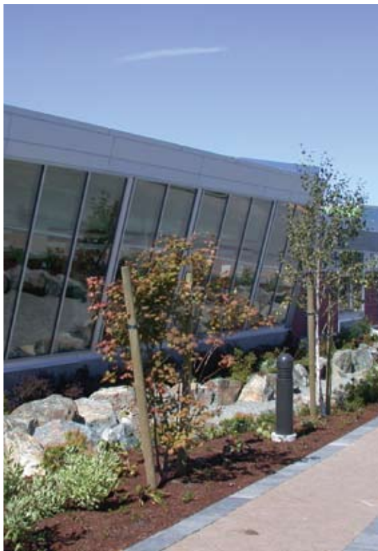
Greater Victoria Public Library ~ Saanich Centennial branch

Buildings themselves also have a profound effect on the environment and health, as they consume large quantities of energy, water, and materials, and emit significant levels of greenhouse gases and generate other waste. These impacts can be significantly reduced through sustainable green building practices that construct buildings in a more efficient, healthy, and ecologically responsible manner. As green building technology continues to be introduced to the market, the associated financial implications to development, and the availability of trained builders and consultant will need to be taken into account when moving towards the goal of becoming more sustainable.