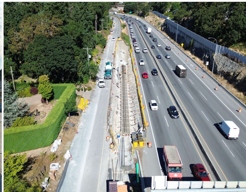
Portage Road retaining wall construction

For more information: www.gov.bc.ca/hwy1busonshoulder BusOnShoulder@gov.bc.ca