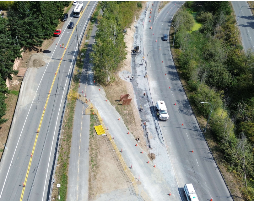
GGT detour for GGT multi-use bridge construction