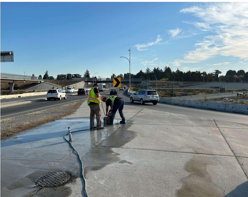
Transit stop preparation at McKenzie Ave/Admirals Rd