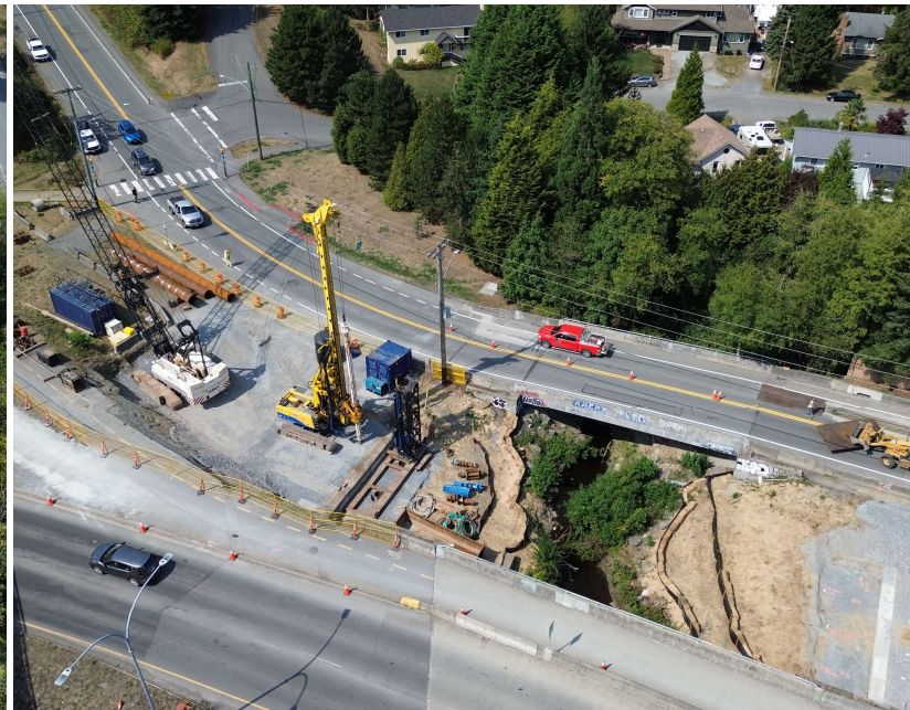
Pile installation for GGT multi-use bridge