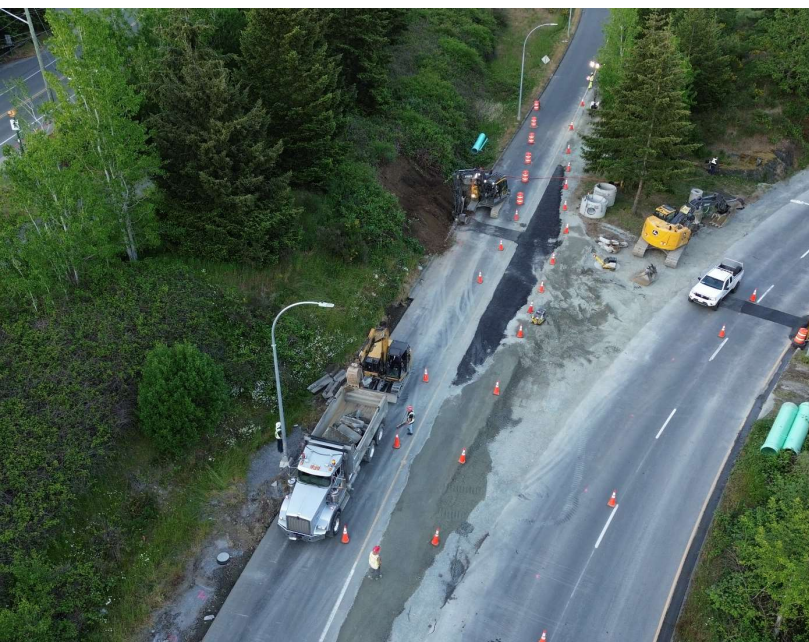
Road widening and drainage works at Burnside Rd West (Highway 1 offramp to Colwood)