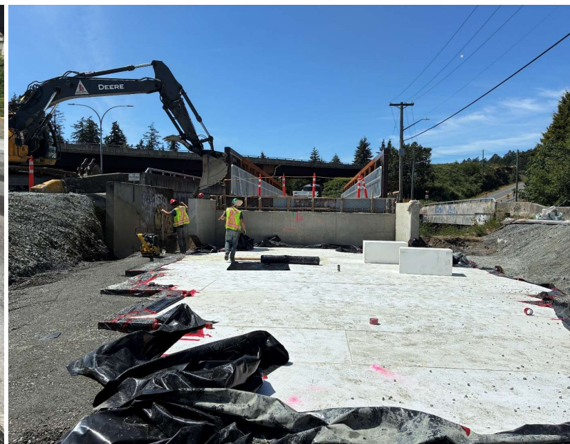
Galloping Goose Trail multi-use bridge construction