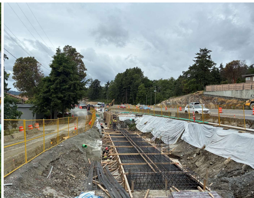
Portage Road retaining wall construction

For more information: www.gov.bc.ca/hwy1busonshoulder BusOnShoulder@gov.bc.ca