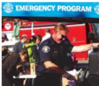
Food & Drinks