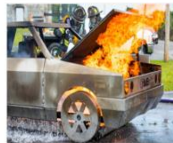
Car Fire & Auto Ex Demos