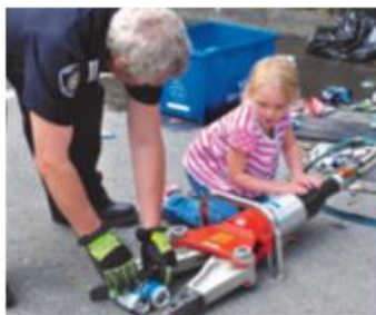
Hands on Demos